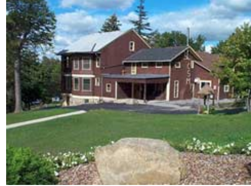
The Big House at Camp Stella Maris.

need to bring your toiletries. The Camp has bunk beds so be prepared to feel like you are in school again, away at summer camp! We do not have any formal workshops, but feel free to share any fun ideas or craft ideas you think the others will enjoy. Don't forget to bring your spinning wheel, spinning fiber and possibly your work in progress.